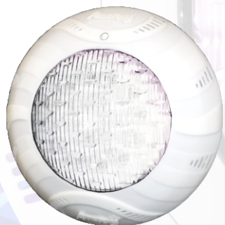
Commercial White Light