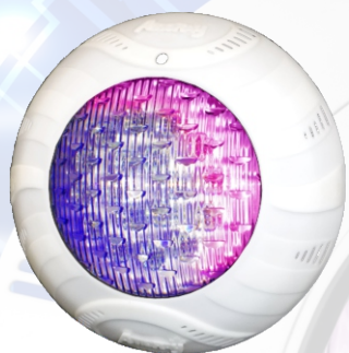
12" Original 13 Color Shows